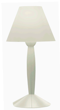
Table lamp providing direct and diffused light. Injection-molded colored polycarbonate lamp body, diffuser and diffuser support.